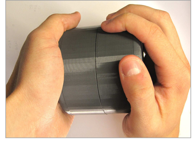
Figure 1: Interactive Generator is a self-powered general purpose wireless controller capable of providing haptic feedback.

Copyright 2011 ACM 978-1-4503-0267-8/11/05....$10.00.